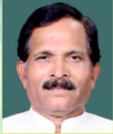
Shri Shripad Yesso Naik Hon'ble Union Minister of State (Independent Charge) Ministry of AYUSH, Government of India