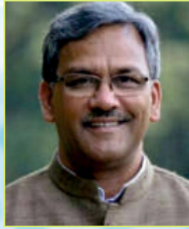
Shri. Trivendra Singh Rawat* Hon'ble Chief Minister Government of Uttarakhand