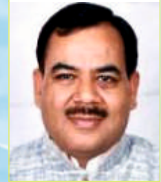
Dr. Harak Singh Rawat Hon'ble Minister of AYUSH & Ayush Education Government of Uttarakhand