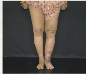
Follow up 25-1-2019