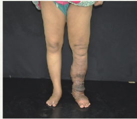
Follow up 10-11-2016