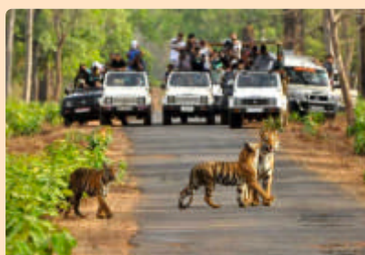
Tadoba Tiger Reserve (100 km)