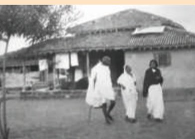
Bapu Kuti (5 km)