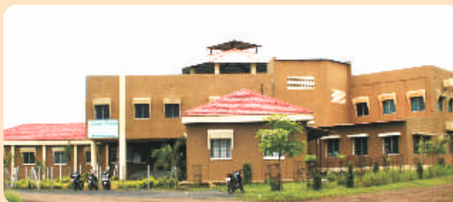
Datta Meghe Institute of Medical Sciences (DU)