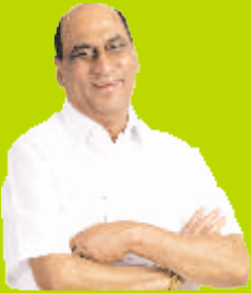
Hon'ble Shri Dattaji Meghe, Chancellor, DMIMS (DU) Ex-member of Parliament