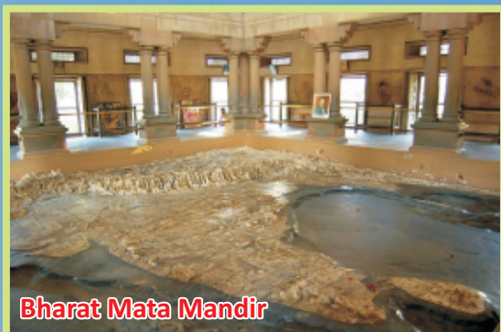
Bharat Mata Mandir